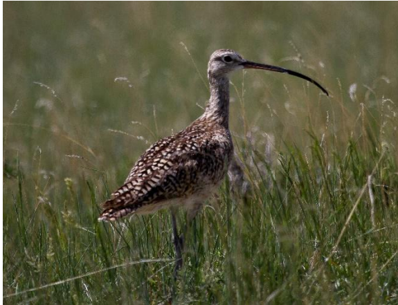
Photo: Long-billed Curlew

Grasslands, coulees and riparian areas meet in Writing-on-Stone Provincial Park (WOSPP), creating a great diversity of habitats for wildlife. Many species of fish, amphibians, reptiles, mammals and over 160 bird species have been recorded within the park. We have counted 238 species of birds in the count area since 2001. The count area includes WOSPP; Crow Indian, Verdigris and Pakowki Lakes; Pinhorn provincial grazing reserve; Manyberries, Ketchum and Canal Creeks; and remote areas along the Milk River.