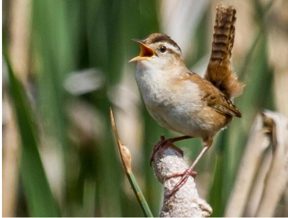
Photo: Marsh Wren

Lake Newell, Brooks and the surrounding area feature diverse prairie grassland plant life, irrigated farmlands, and many (255) species of birds such as Burrowing Owl, Black-necked Stilt, Grasshopper and Baird's Sparrow, Ferruginous Hawk, Long-billed Curlew, an abundance of spring warblers in riparian areas, and animals such as: Pronghorn Antelope, Prairie Rattlesnake, Great Plains Toad and many more.