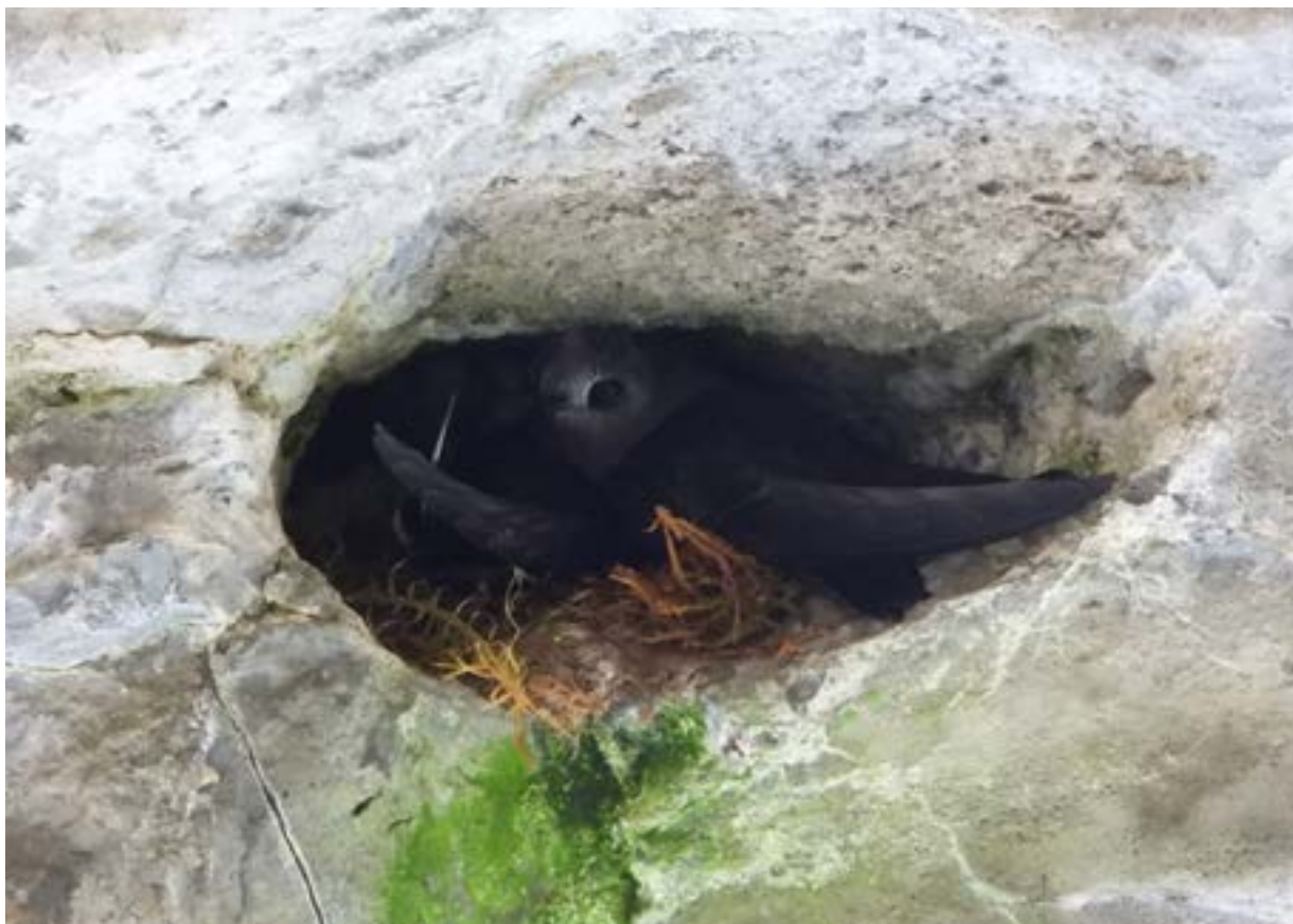
Black Swifts

Presentation: Black Swifts ( Cypseloides niger borealis ) are the largest swifts in North America and the only subspecies to occur in Canada. This high flying aerial insectivore is the ultimate habitat specialist seeking commanding views of plunging waterfalls to nest beside. The species was listed as Endangered in Canada in 2019 due to steep declines in the Canadian population. In Banff National Park, Black Swifts have been observed nesting in the park and on the eastern edge of their range since 1919! Researchers are implementing an array of tools to better understand these cryptic creatures who spend most of their lives on the wing! Come find out how Black Swifts are doing in Johnston Canyon and how creativity is key to studying them.