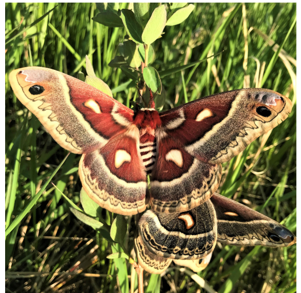
Image: Columbia Silk Moth

This annual event is free and open to anyone with an interest in lepidoptera (moths and butterflies). The Alberta Lepidopterists' Guild (ALG) will be hosting events throughout the province during the week, but don't worry... you can set-up your moth-lighting experiment in your yard! Take photos and share your sightings to iNaturalist.ca to be identified by ALG experts. For more information and resources, visit: www.nationalmothweek.org/