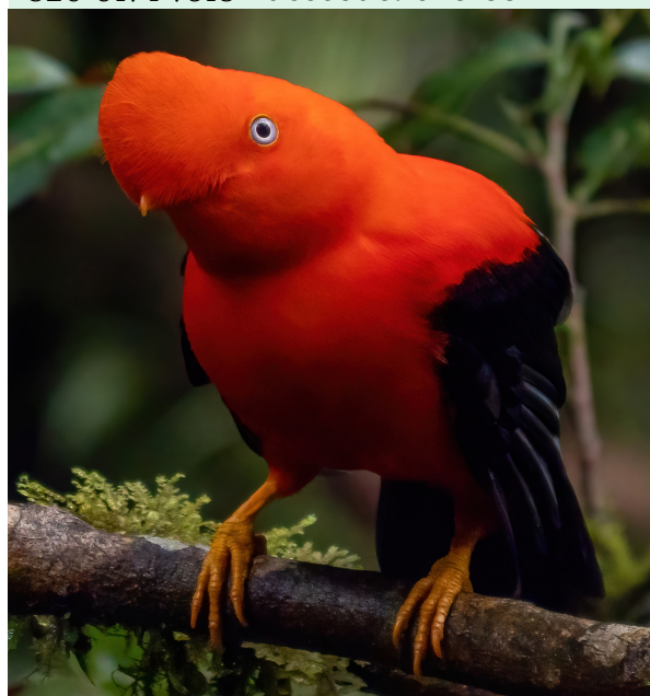
Cock of the Rock