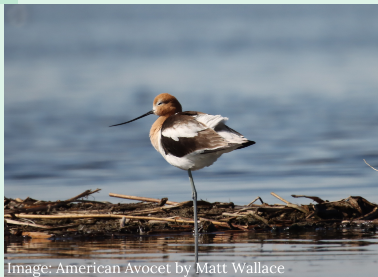
Image: American Avocet

What do you get when you combine a landfill, storm water ponds, a dog park, and a wetland? Join Nature Calgary and guest speakers discussing the unique urban environment of Elliston Park and why it is one of the best places to view epic birds right in the city. Together, we will discuss the important role wetlands play in our communities and how they can provide refuge for wildlife and people. Registration Link (Free Event)