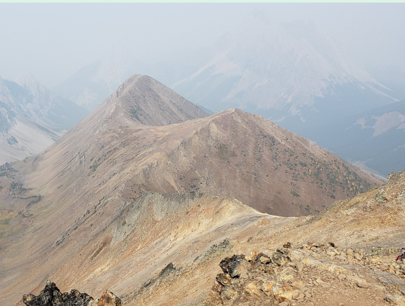
Pocaterra Ridge