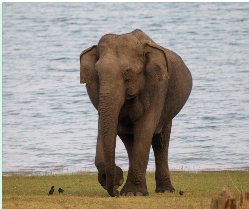
Elephant