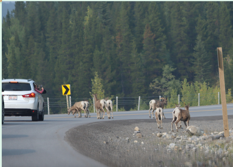
Bighorn Sheep