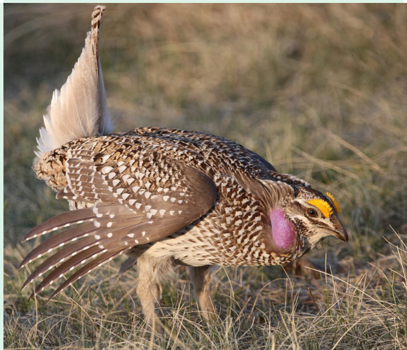
Sharp-tailed Grouse