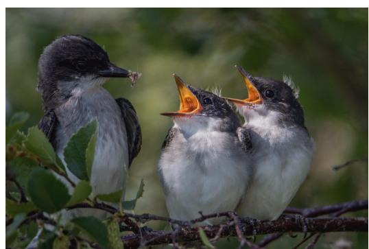
American Dipper (top) and Easter Kingbird with babies (bottom)