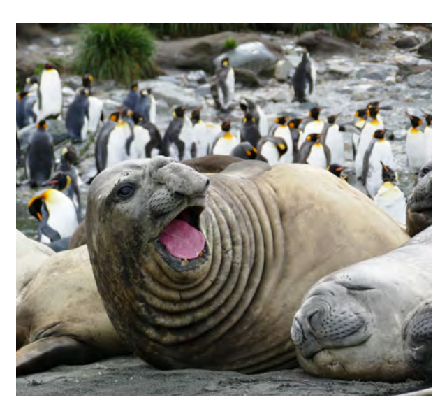
Elephant Seal

Sun Oct 28, 9:30am to approx 4:30pm: Wind your way through the hills south of Calgary to Pine Coulee Reservoir west of Stavely for migrating waterfowl, Raptors, migratory Songbirds, Gulls, and others. There will be a stop at Chain Lakes and the scenery will be incredible. Meet at the large parking lot at Fish Creek