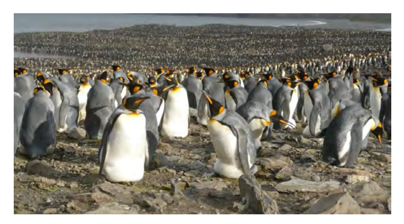
King Penguins