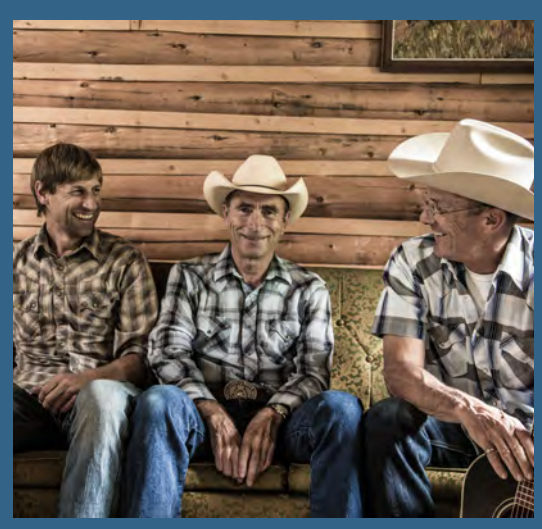
Saturday, November 10th Cocktails 6:00pm | Dinner 7:00pm

The Wardens are a Banff National Park-based trio who sing about experiences as park wardens and the land they've protected for a collective 60+ years. They will also present a slide show.