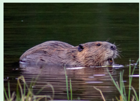
American Beaver