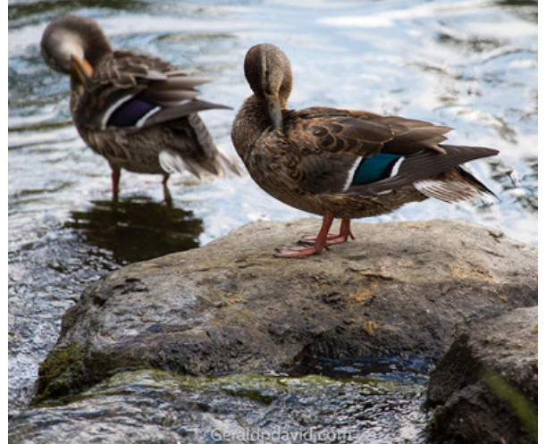
Mallards