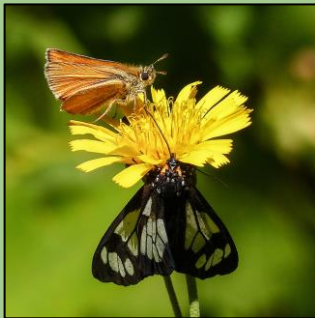
Skipper and Police-Car Moth

Nature Calgary (Calgary Field Naturalists' Society)