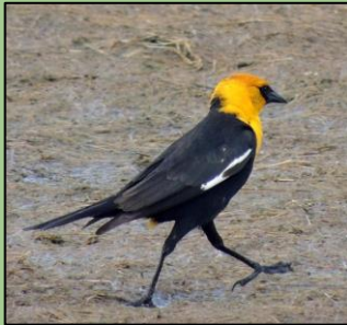
Yellow-Headed Blackbird

Nature Calgary is run entirely by volunteers! For current opportunities see www.naturecalgary.com/get-involved/