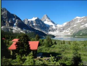
Mt Assiniboine Lodge

Volume 36, Number 1 http://naturecalgary.com