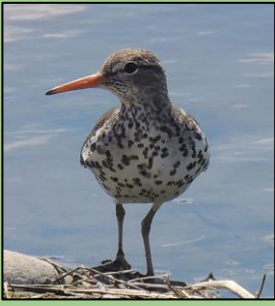
Spotted Sandpiper