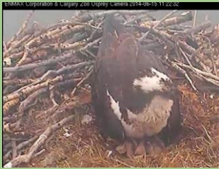
Zoo Osprey webcam

Contact us at Nature Calgary PO Box 981, Station M, Calgary, AB T2P 2K4 Email: info*@naturecalgary.com