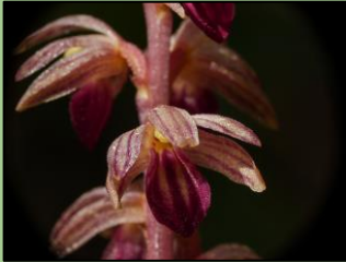
Striped Coralroot Orchid ( Corallorrhiza striata )

Volume 35, Number 8 http://naturecalgary.com