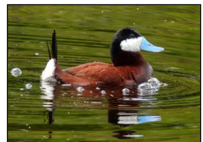
Ruddy Duck