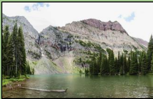
Cameron Lake, Waterton Nat. Park

Nature Calgary (Calgary Field Naturalists' Society)