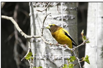
Evening Grosbeak