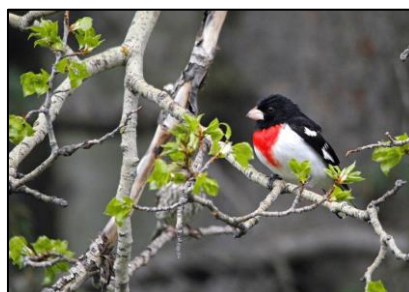
Rose-breasted Grosbeak