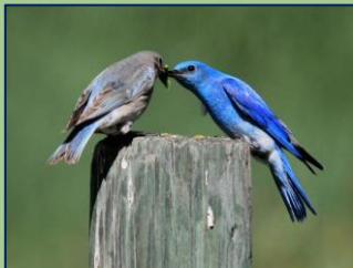
Mountain Bluebird pair

Field trip leaders please turn in signed waiver forms to Nature Calgary, Box 981 Stn. M Calgary, AB, T2P 2K4, or at General and Bird Study meeting welcome tables. Latest version of the waiver form is available http://naturecalgary.com/field-trips/leaders/