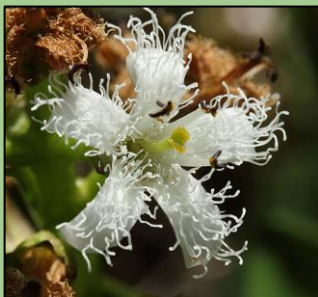
Buckbean (Menyanthes trifoliata)